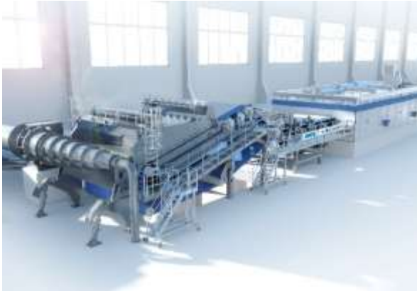
New ANDRITZ neXline Wetlaid for glassfiber.