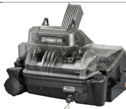
S3260 electronic rotary dobby