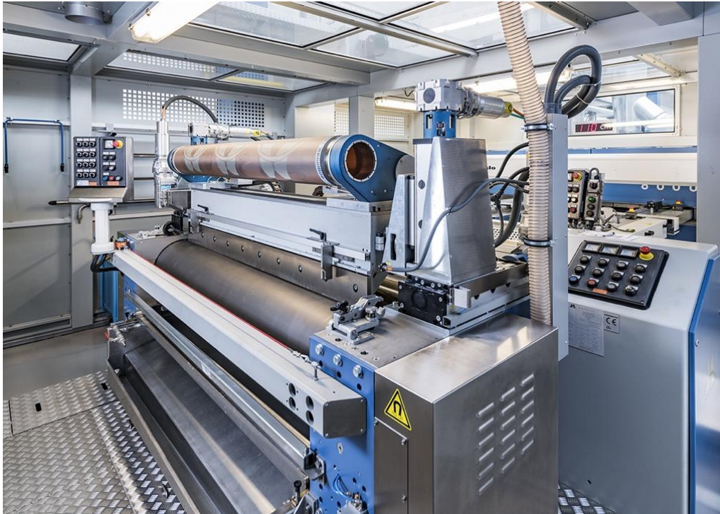
Montex®Coat unit integrated into the full technical textiles pilot line at the Monforts ATC.