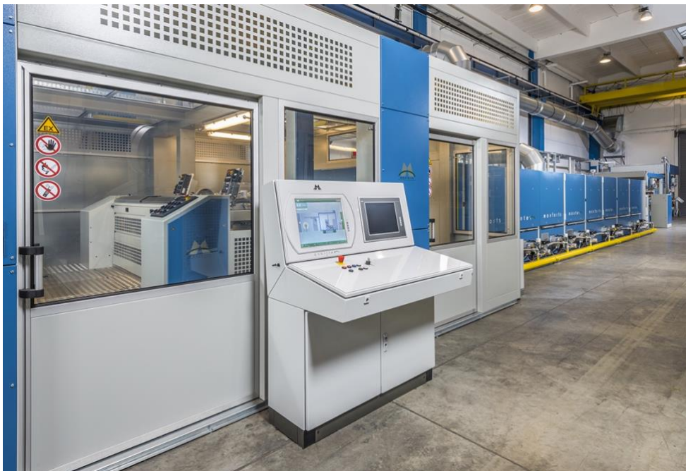
The technical textiles line at the ATC is fitted with an explosion-proof coating application chamber