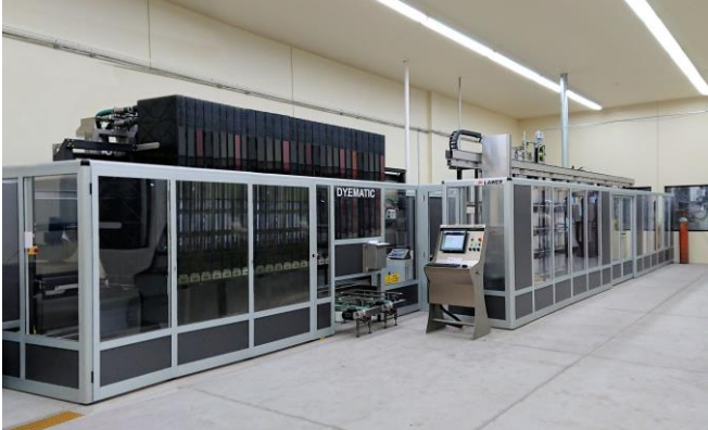
DYEMATIC S 00

every stage of production in its facilities, with both raw materials, auxiliary materials and end use which are not harmful to human health and do not contain carcinogenic substances and have the international Eko-Tex 100 standard document certifying this.