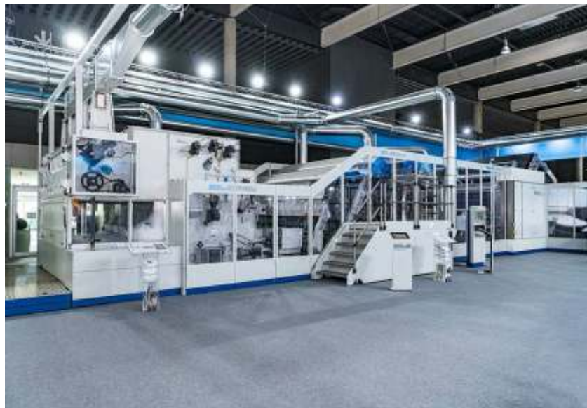
Dilo needling line

When recycling textile waste in the context of the collection of used clothes, the so called “filament-saving” tearing using special tearing machines and methods must be used to produce fibres with longer staple lengths which can be fed to a nonwoven installation. Hence product characteristics can be better specified and controlled.