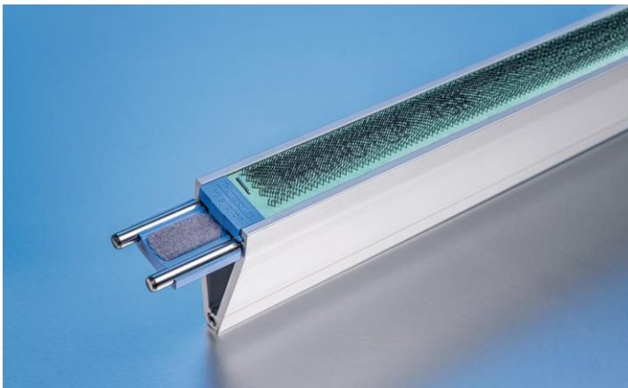
MT/PT 45R flat top for recycling

From waste to value: Balkan and Trützschler process for the recycling of hard textile waste.