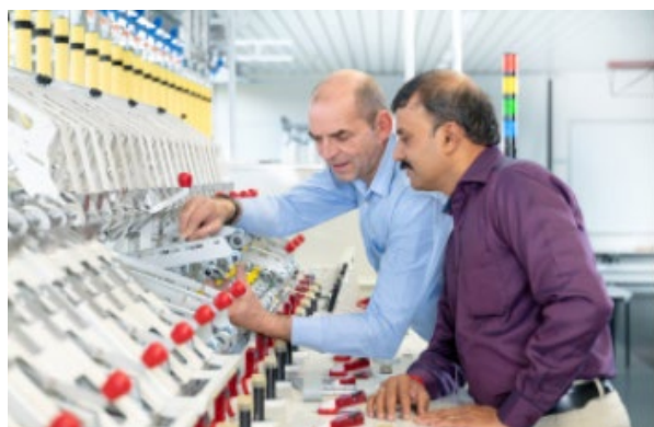
Fig. 2: Comprehensive customer service for mechanical and electronic repairs.