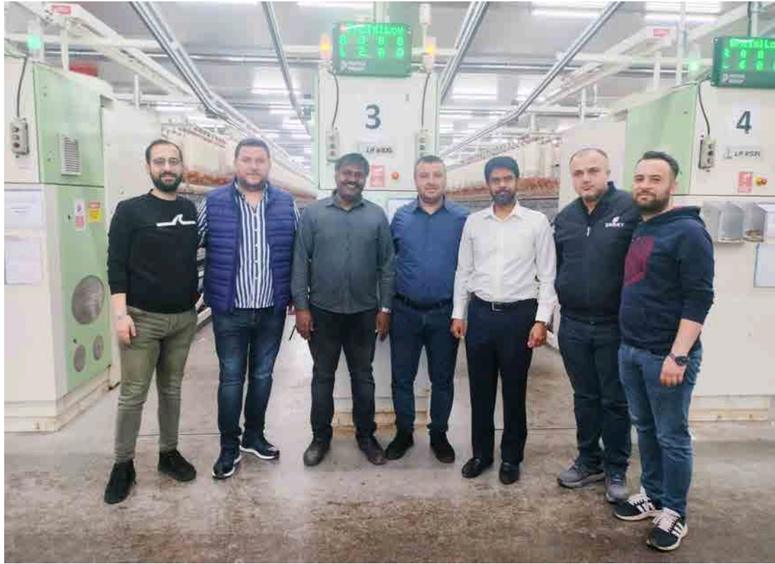
The technical team at Erbey İplik's along with LMW Team

Erbey İplik's strong association with LMW over the past seven years has been a cornerstone for the success. Their facility serves as a reference point for LMW in Turkey, hosting numerous customer visits and demonstrating the excellence achievable with LMW technology.