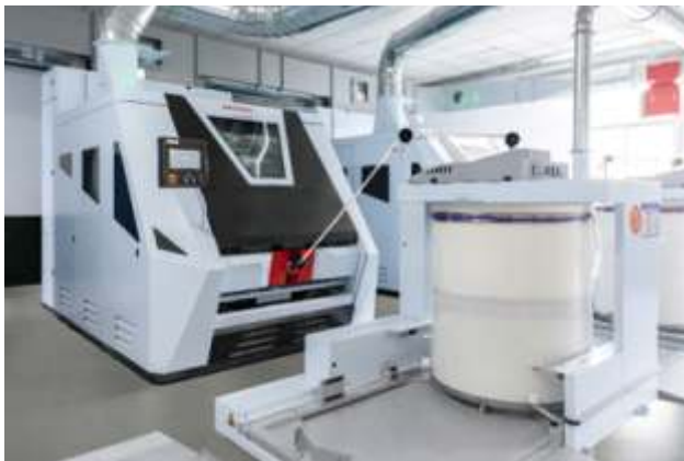
High-performance Autocard SC8 is designed to deliver superior yarn quality.

Among its pioneering highlights, the Autocard SC8 with Autocoil 3 introduces the revolutionary PDS Pre-Draft System and rectangular cans, optimising energy efficiency while ensuring superior sliver quality. The Hunter S1 AGV , with its lift-and-transport design, reimagines material handling through seamless automation, while its integration with the Saurer Senses Mill digital management system embodies true Industry 4.0 intelligence.